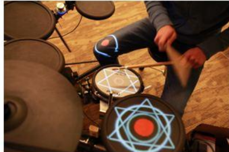
Figure 2. install and performing situation